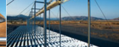
Linear Fresnel Technology