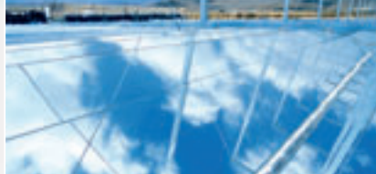
Linear Fresnel Technology